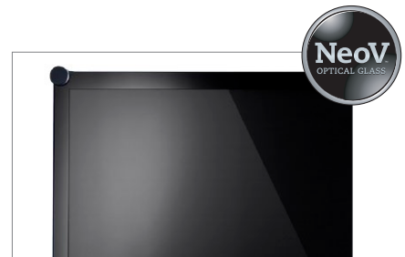
NeoV™ Optical Glass protects against scratches, impacts and other physical damage