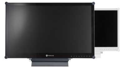
Available in black or white