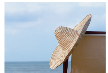
AG Neovo RX-Series