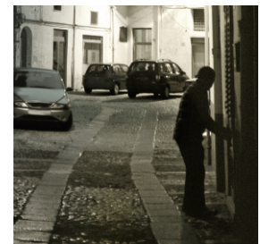
AG Neovo RX-Series